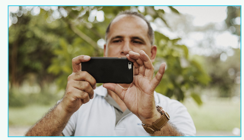
Ask a friend to shoot your video, but remember: hold the device horizontally!