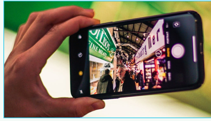
Don't have a busy background, look for neutral colours, no distracting objects.