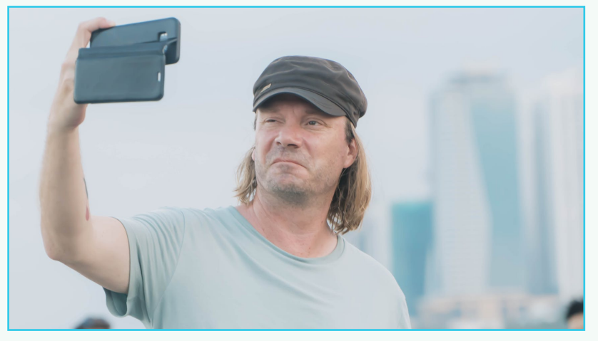
Have fun, investors want to see your personality! Stick to 90 seconds MAX!